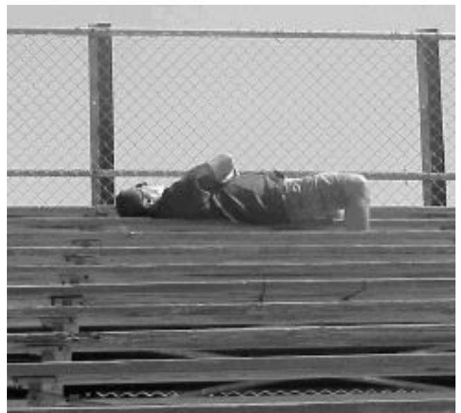
Fo's cat-like abilities

The good news is that there was no blood, so it's just a minor inconvenience. One I hope to never face again.