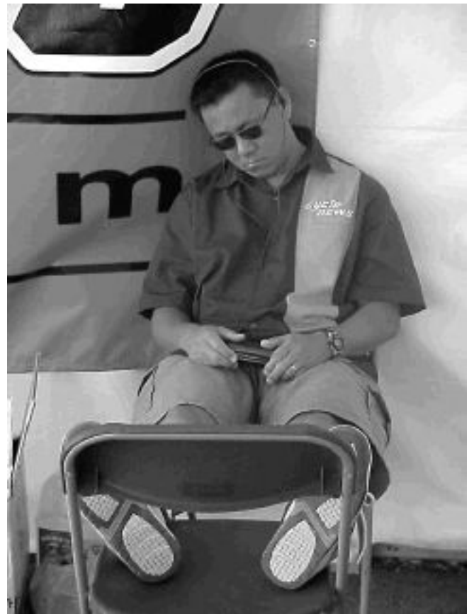
Dreaming of Membership Dues (he looks so sad)

I will be available to give you more detailed advice via e-mail when you want to get started. Next month I will write about training logs.