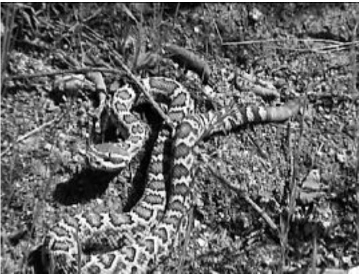
A Doug's eye view of the wildlife