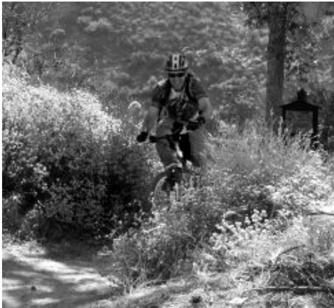
Ride with us...be happy

b Don't miss our Back-to-School rides! b