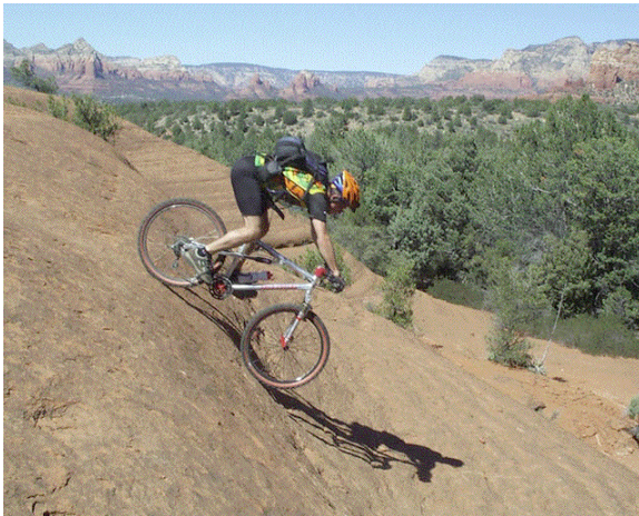
Just some ol' picture I had laying around (Sub Rock at Sedona)