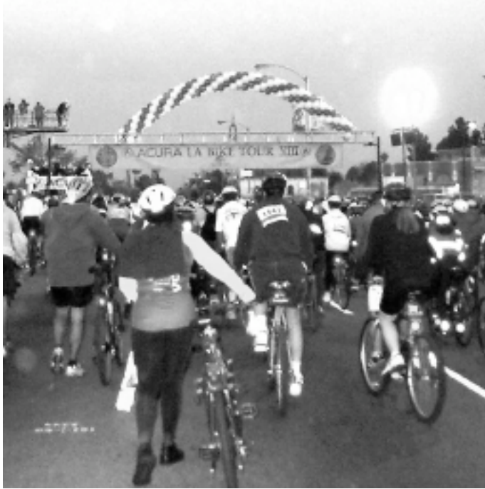
Last year's L.A. Bike Tour start (lightened up).

is not as bad when your starting from the back of the pack. You get an amazing view of long streets stretching for miles, filled with nothing but bikes. Being in the back, you also get more of the spectators coming out and cheering you on as you ride by.