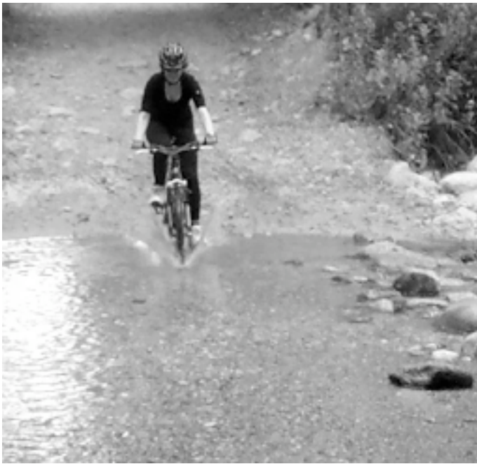
Remember back when we had water?