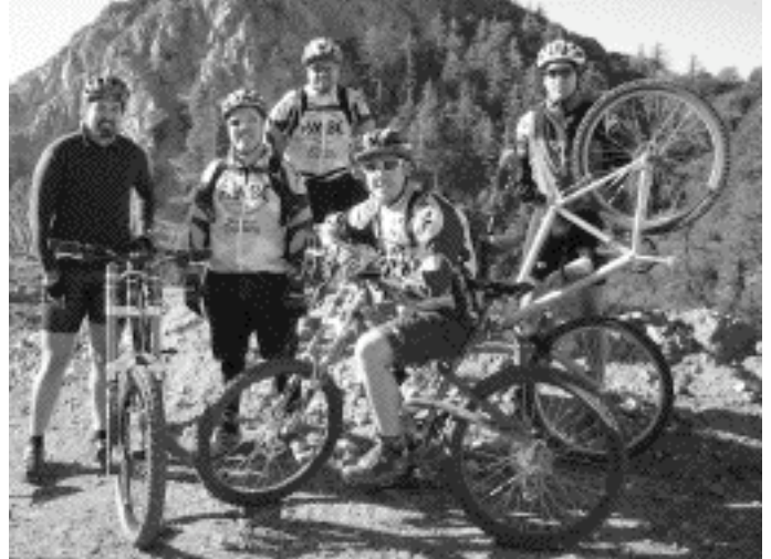
The mad, but stylish, Dive Bombers.

Helmets required on ALL rides! Call the RideLine at (626) 577-RACE for info