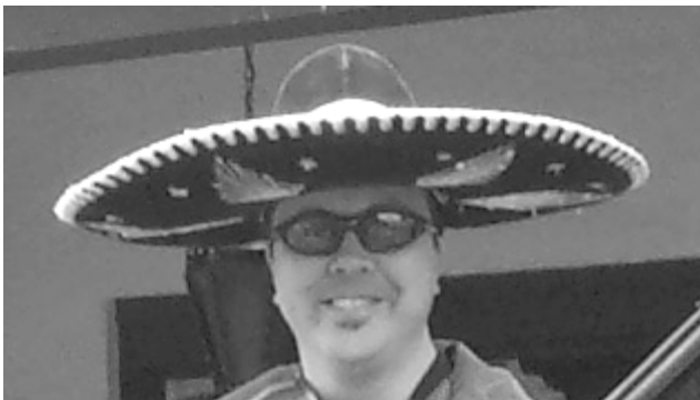
Señor Montaña Rocosa.