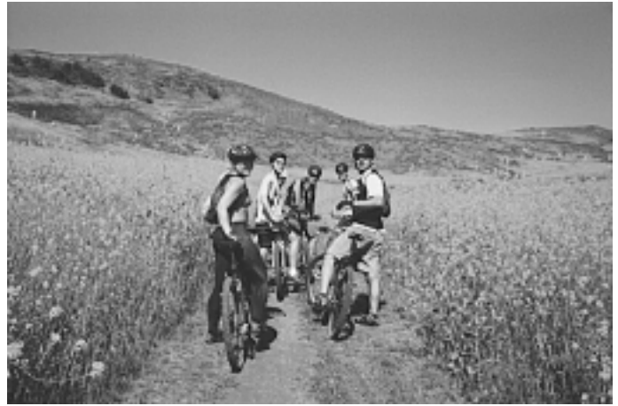
Enjoying the view at El Moro Canyon in Laguna Beach

The PMBC ventured down to OC's El Moro Canyon north of Laguna Beach on Saturday, April 1st. Fofu led the group, some of whom had never turned a wheel in the dirt. The park's fire road sections had been graded recently, revealing a whole lotta rocks and loose debris.