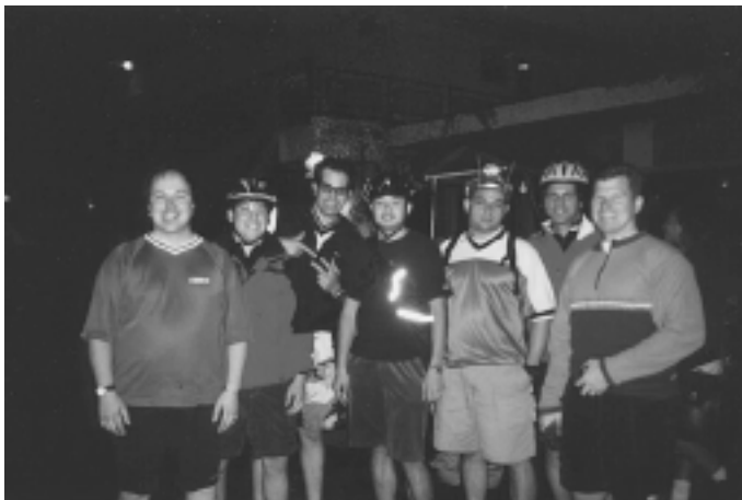
The Taco Truck Tour Gang minus Fofo, he's taking the picture