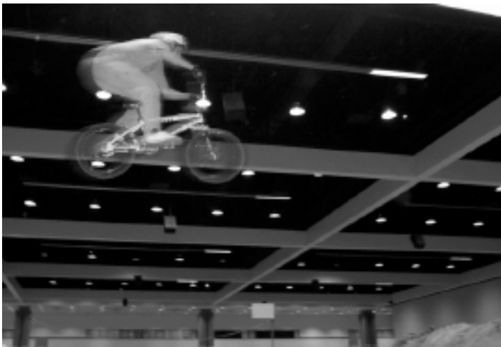
BMXin' at Bike Expo