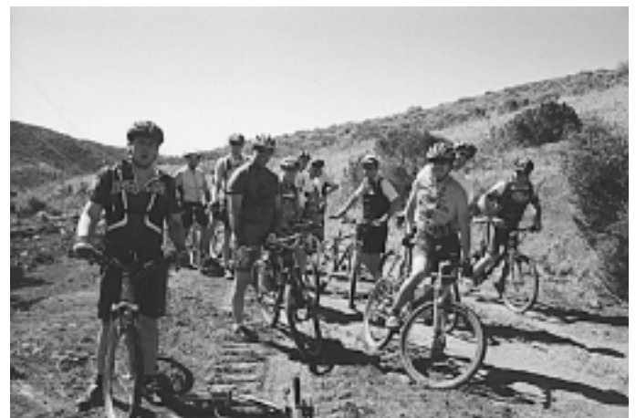
Taking a break after the first climb at El Moro Canyon