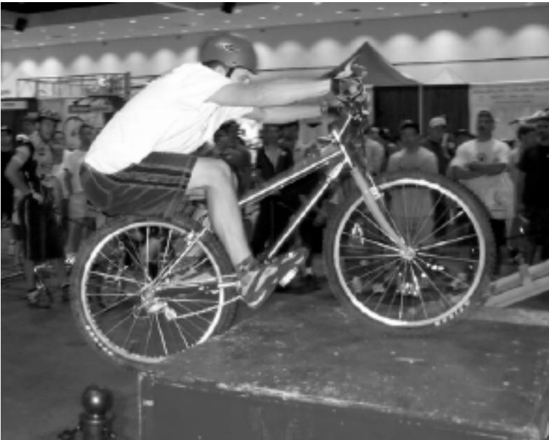
Hanging On For Dear Life