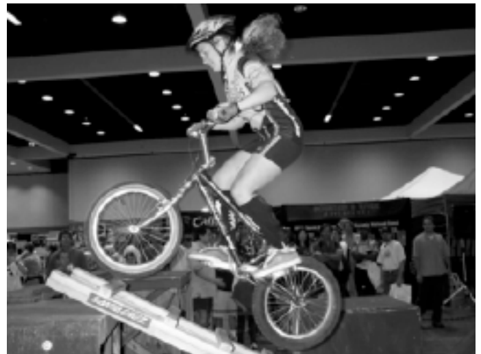
See? Girls ride too!

I'll definitely go again next year, but hopefully on the first day when it's a bit less crowded and everything's in prime condition. If you missed it this year, and have never been to the show, go next year and check out the poorman's Interbike.