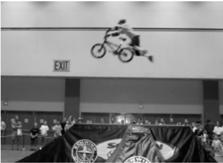
Look ma! No feet!