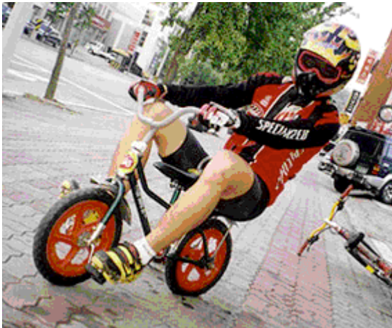
The club for serious mountain bikers (picture from www.mtbr.com )